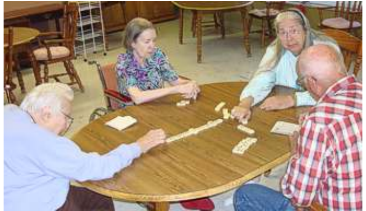
After- hours Dominoes - a serious but enjoyable game!