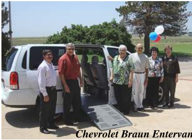
Chevrolet Braun Entervan